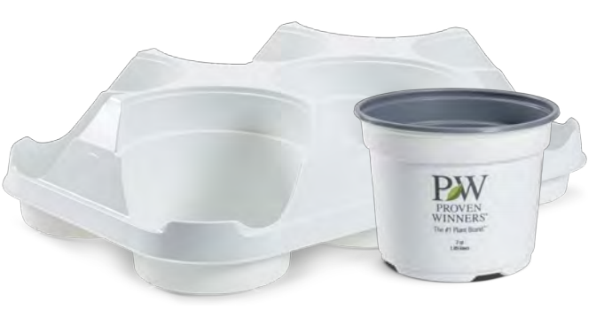
Co-Ex 6.5 container with 6-count tray