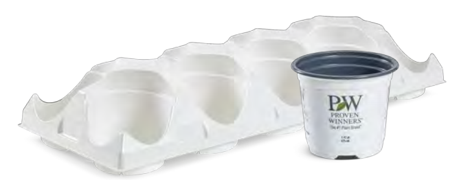
Co-Ex Classic™ container with 10-count tray

Calculate the quantity of branded containers needed to match your production plans. Branded containers are required for all single pot production for retail sales at a 1:1 plant to pot ratio. Plants sold for landscape markets are excluded from using branded containers. Trays are highly recommended, especially for our Grande™ and Eco+ Grande™ branded containers which use our Self-Symetricize™ technology. Order in bulk to receive branded containers ahead of the growing season or receive them along with your liner orders. Contact your propagator for additional container sizes that may be available if needed.