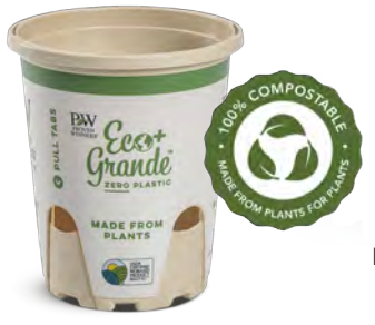
Eco+ Grande® container Sobkowich only Limited availability for 2025