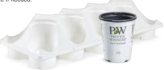
Co-Ex Grande™ container with 10-count tray