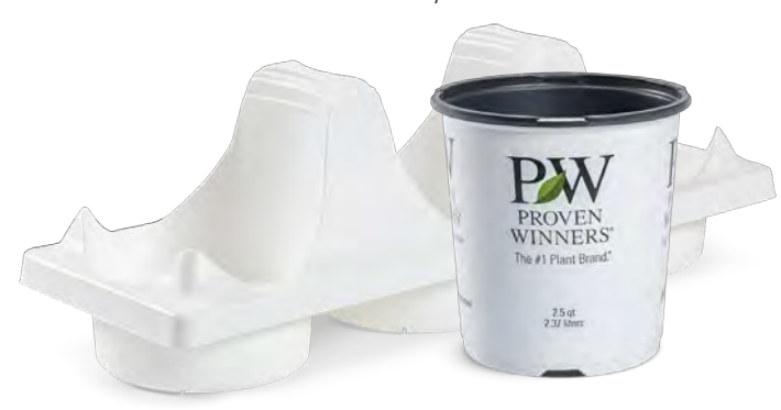
Co-Ex Royale™ container with 3-count tray